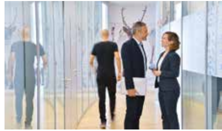
→ GAP 15 | Destination for stars and newcomers

Düsseldorf has the perfect infrastructure for every type of business – for startups and established corporate players, newcomers from Germany or investors from abroad, lone wolves and team players – for 1 day, 1 year or longer. The city is home to 51 business centers and co-working spaces with around 85,000 square meters of flexible space. The Düsseldorf commercial real estate market offers an extensive, highly differentiated range of options in all types of properties.