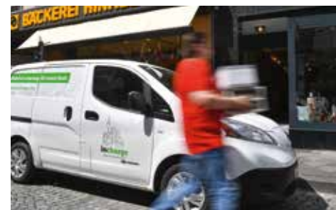
→ Incharge | Startup offers environmentally friendly urban logistics

Düsseldorf's strength is its ability to embrace change early on – and put it to good use. Progress and innovation are integral parts of this city.